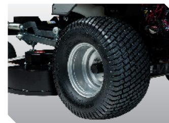
More Traction – Large 22" rear tires with for more traction and stability