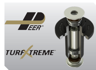
PEER® Spindles – Maintenance free with Contamination Exclusion Technology