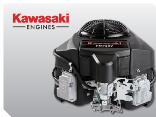
Kawasaki Engines – Reliable power to tackle the toughest jobs