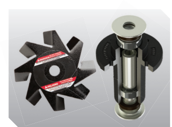
Spindle Package - Maintenance-free spindles and cooling fans come standard