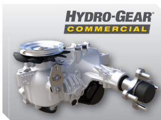
Hydro-Gear® ZT-3100 – Commercial duty drivetrain with serviceable filters