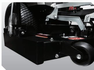
Discharge Chute – Take full control of clippings with the OCDC