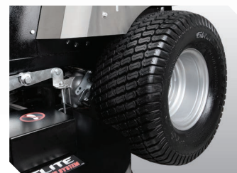
Large Rear Tires – More traction, more speed, and better stability