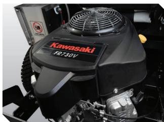
Proven Power – 24hp Kawasaki engine for more performance and reliability