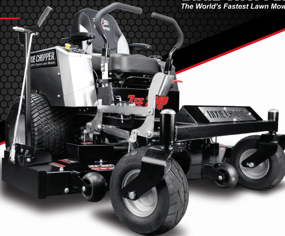
Zee 2 HP - 2454KW model shown*