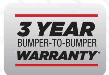
*unlimited hour limited warranty