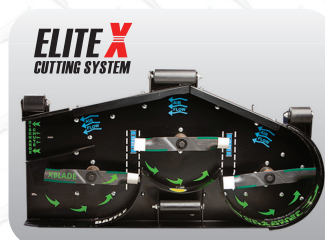
50", 60", and 72" Elite X Deck – Gives a quality cut in all types of grass