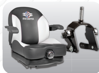
High Performance Package – Comes standard on select models.