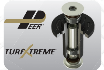
PEER® Spindles – Maintenance free with Contamination Exclusion Technology