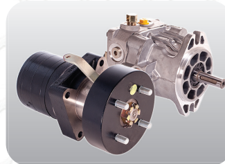
Pumps & Wheel Motors – Stronger transmissions for extended system life.